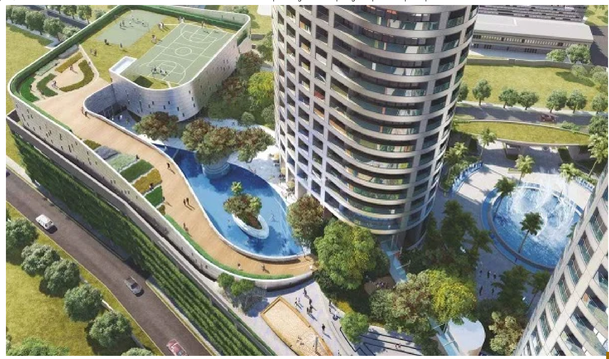
Lodha Azur Address