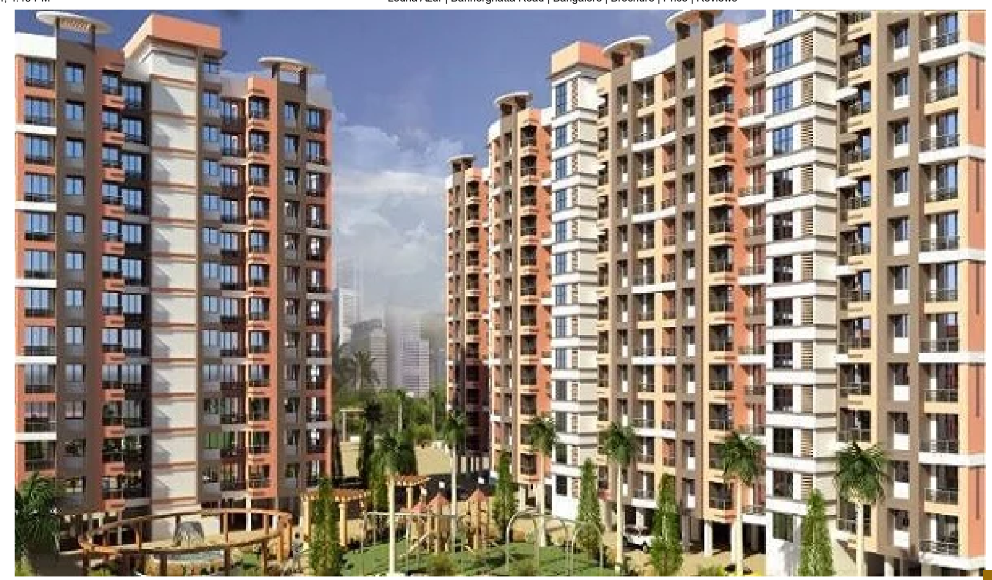
Lodha Azur Project Status

Disclaimer: The content is for information purposes only and does not constitute an offer to avail of any service. Prices mentioned are subject to change without notice and properties mentioned are subject to availability. Images for representation purposes only. This is the official website of authorized marketing partner. We may share data with RERA registered brokers/companies for further processing. We may also send updates to the mobile number/email id registered with us. All Rights Reserved.