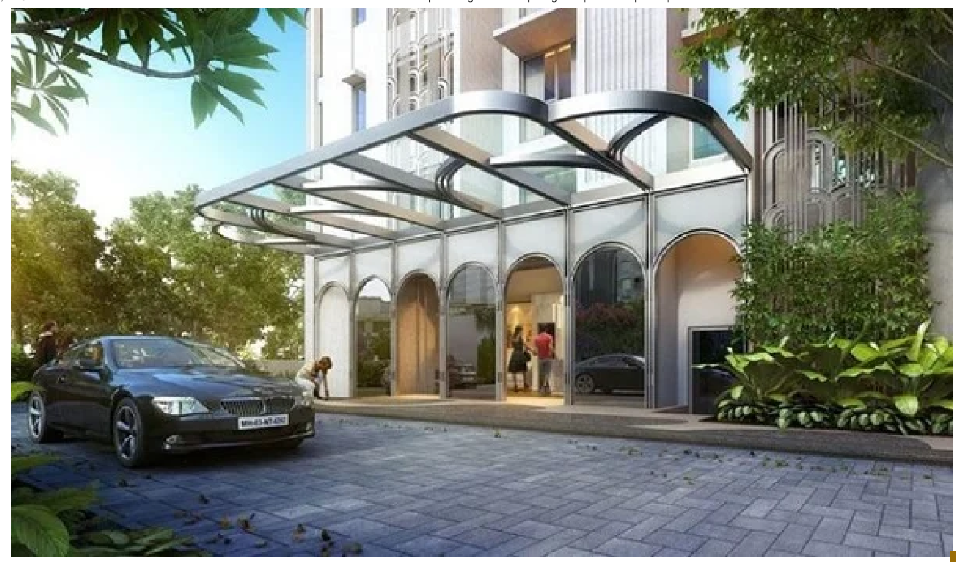
Lodha Azur Price List