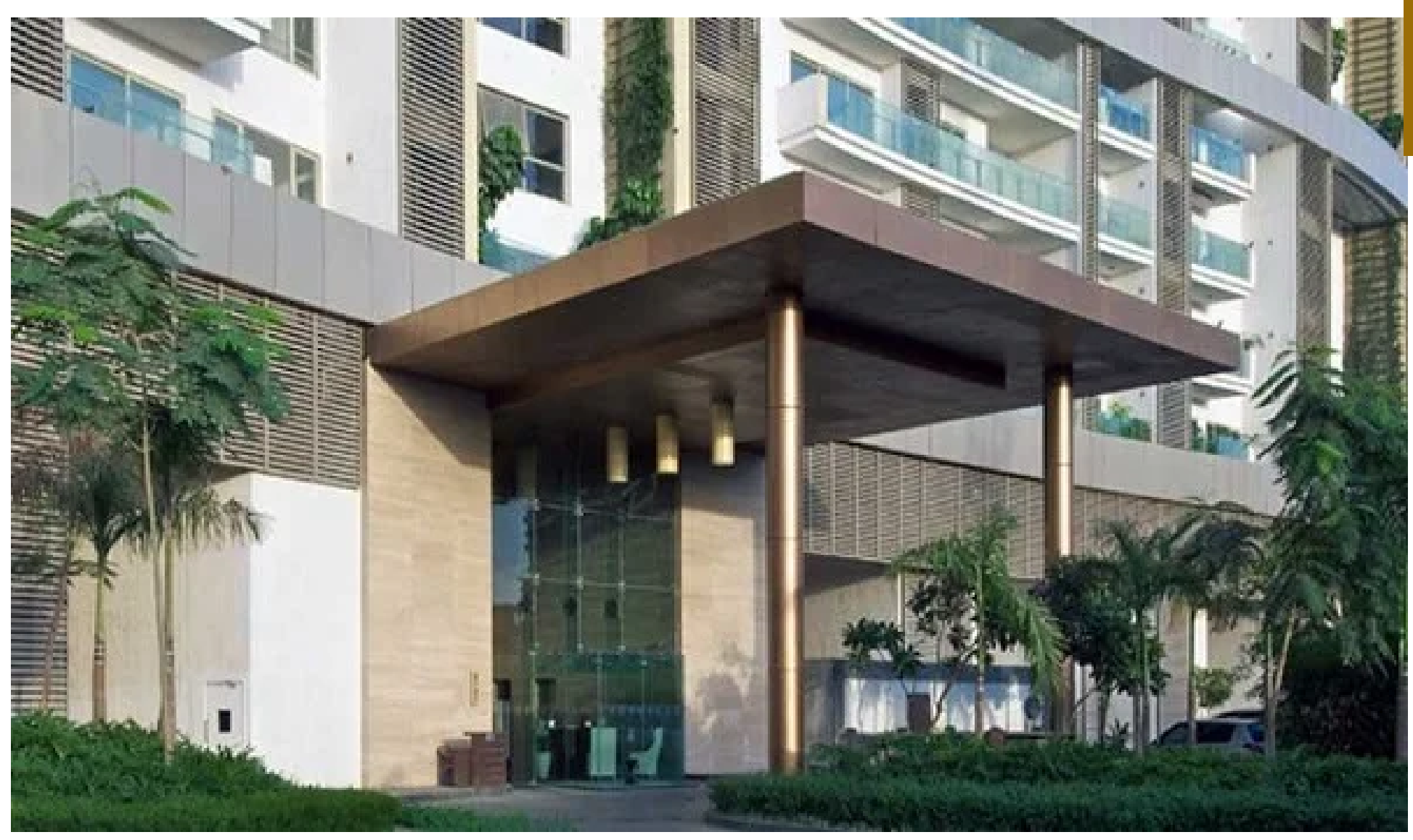
Lodha Azur Penthouse Price