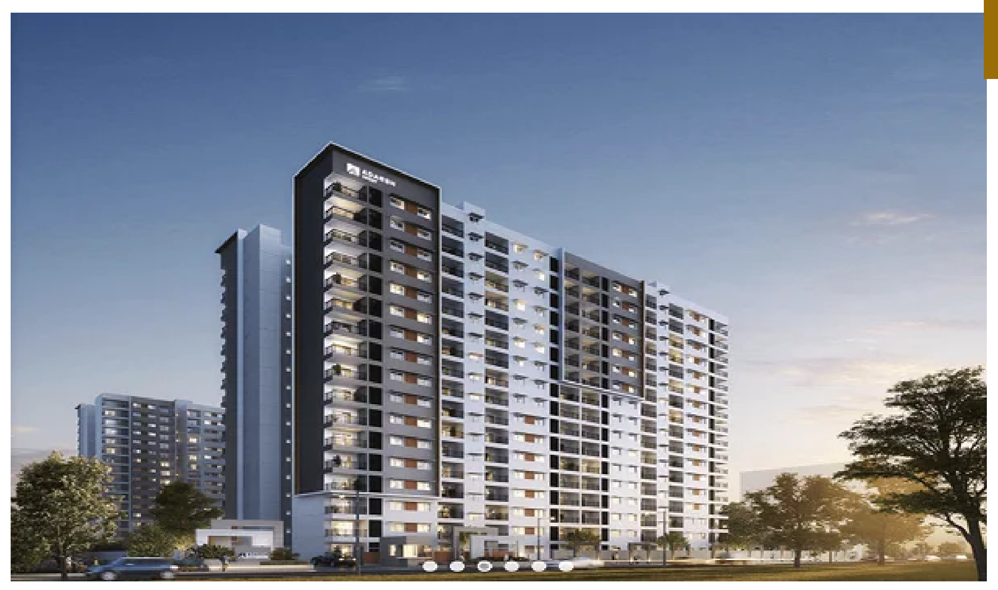
Lodha Azur Apartments