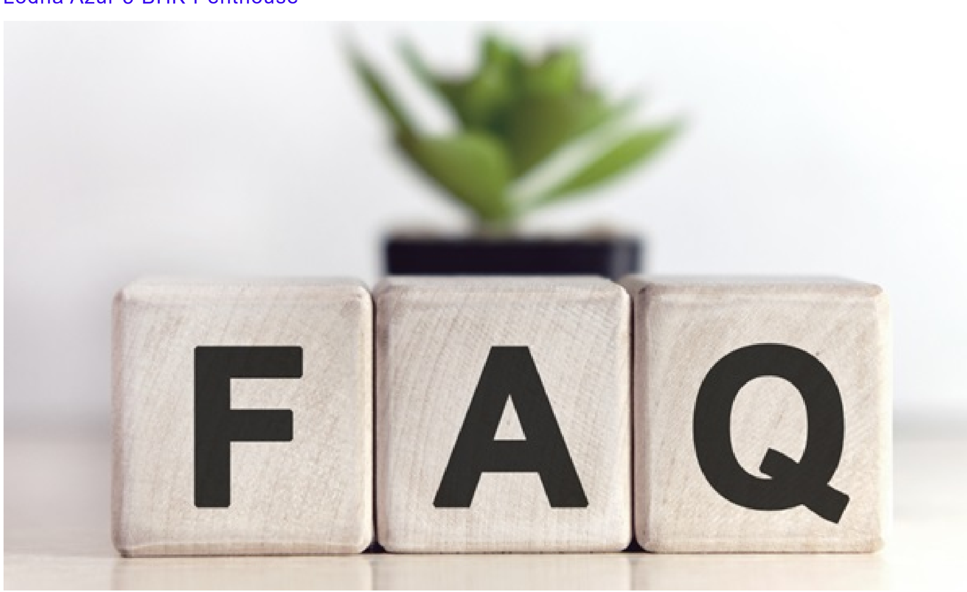
Lodha Azur FAQs