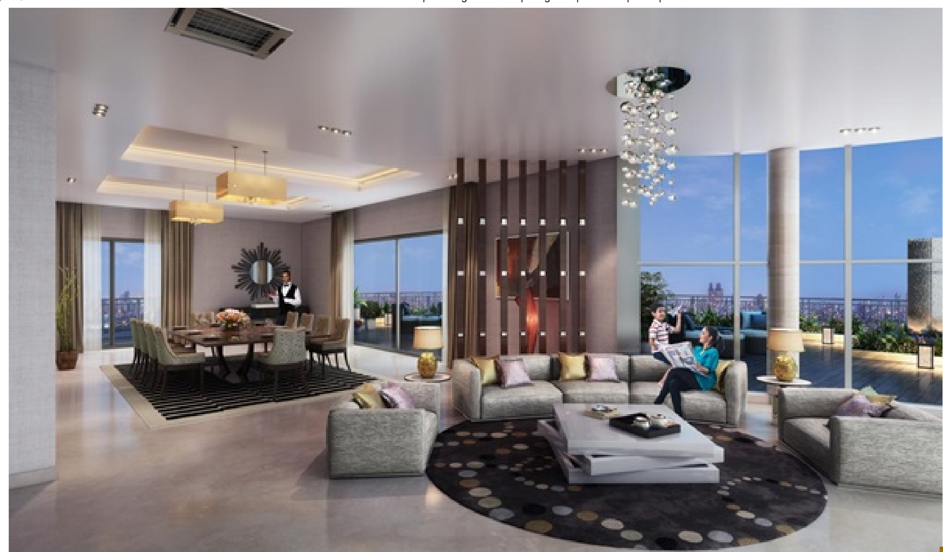
Lodha Azur 5 BHK Penthouse